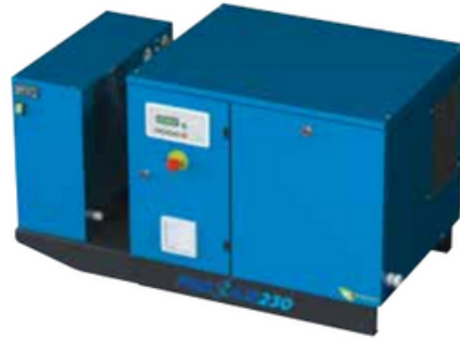
VARIABLE SPEED FLOOR MOUNTED, WITH DRYER