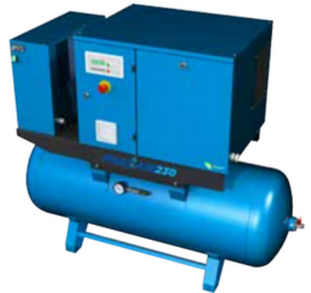
VARIABLE SPEED RECEIVER MOUNTED, WITH OR WITHOUT DRYER

Our new model represents the highest evolution of the PhazAir-230 range, thanks to the electronic control unit 'K TRONIC 5' running all of the compressor functions/indicators: loading/idling cycle, working hours, oil temperature, working pressure, alerts. This is a technological solution to an age old problem, providing a much higher capacity to users limited by a single phase 230V power supply!