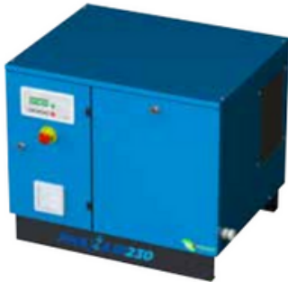
VARIABLE SPEED FLOOR MOUNTED